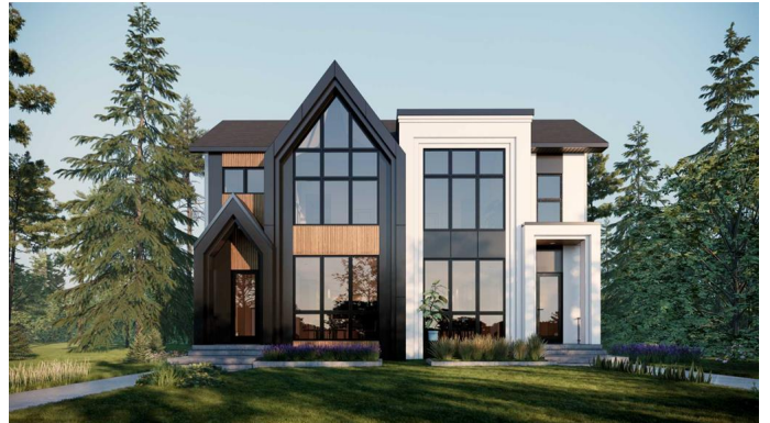
1917 21 Avenue NW (Unit 1)

Welcome to this stunning residence effortlessly combining modern architecture and thoughtful design in the heart of Banff Trail, built by the award-winning ACE HOMES. The home boasts desirable SOUTH REAR EXPOSURE complemented by large windows inviting warmth and light into every corner. Over 2600 SQFT of developed space, provide ample comfort and functionality. This home comes equipped with a 2 BEDROOM LEGAL SUITE, with side entrance & laundry facilities there is great potential as a mortgage helper. The main level unfolds with a generous sized dining room complimented by ample lighting from oversized windows. The kitchen is uniquely placed at the centre of the home with stainless steel appliances and high rise custom cabinets, bar seating & expansive built-in pantry. The addition of a MAIN FLOOR OFFICE enhances productivity & organization. Adding to the convenience of the main floor is a half bathroom & mudroom, with custom built-in storage and bench. Upstairs the expansive primary suite welcomes you with sky high VAULTED CEILING creating the ultimate luxurious retreat. The primary suite includes walk-in closet and outstanding 5-piece ensuite complete with free standing soaker tub and walk-in rain shower. Two secondary bedrooms include tray ceiling detailing adding a lux touch. Laundry room with sink and & a linen closet enhance practicality and storage on this level. The legal basement suite makes an impression with