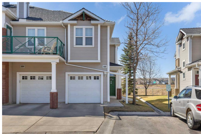
39 Hidden Creek Pl NW #304

Welcome to this beautiful end-unit in Hidden Valley's Hansen Creek Manor! West Backing onto a beautiful nature reserve with a freshwater pond and nestle in very conveniently located in a sought-after community of Hidden Valley NW. This single front attached garage townhouse is idle and perfect for those attempting to downsize into a quiet living space, surrounded by a welcoming neighbourhood with exceptional scenery and many walking paths. Also good for First-Time Home Buyers or investors to live or grow their equity. This home offer you ground floor single attached garage parking and 2nd floor quite living with the beautiful views from spacious and bright living room with cozy fireplace and dining. A very Bright and open concept floor plan loaded with two bedrooms and two bathrooms, open kitchen and dining, multiple pantries and closets. A big master bedroom with 4 pcs ensuite allow you to have your sound sleeps quietly. When the living room off the patio door the huge and sunny deck welcome you for the more sounding nature views and warmth for your summer BBQ to you and your guests. This home is very conveniently and closely located to the Schools, Gas Station, Small plaza with restaurant and other. Also only 2-5 minutes drive to Creekside Shopping Centre. A very easy and quick access to the STONY TRIAL allow you to drive to BANFF, EDMONTON and