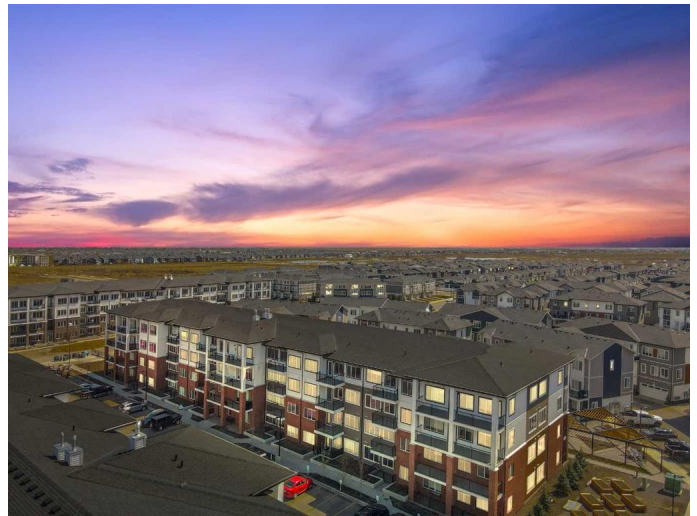
6-3212 Merganser Dr W, Chestermere, AB

Lockwood residents also enjoy exclusive access to a fully equipped fitness centre, an